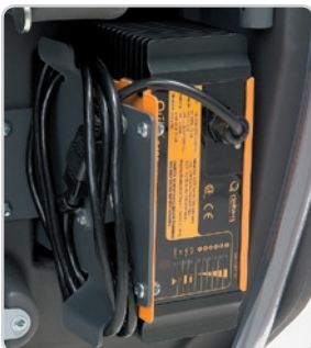
Standard onboard battery charger for wet or gel battery packages.

Indicates Max Solution Flow Indicates Max Scrub Pressure Push and hold Scrub Button for 5 seconds for Extreme Scrub setting