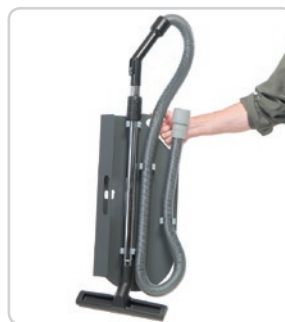
Onboard Scrub-Vac System

14600 21st Avenue North Plymouth, MN 55447-3408 www.advance-us.com Phone 800-214-7700 Fax 800-989-6566