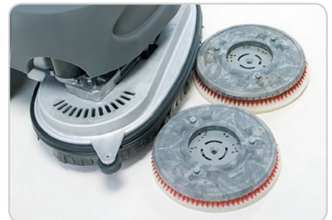
Click-off disc scrub heads for productivity and convenience.