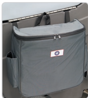
Onboard Tote Bag