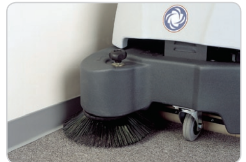
Excellent edge cleaning results from the side broom. Eliminates secondary edge cleaning operation common with vacuuming.