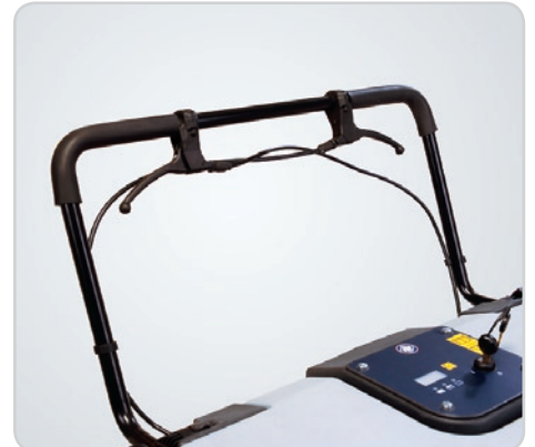
Ergonomic, height adjustable handle design with conveniently located controls for safe and easy use by the operator.