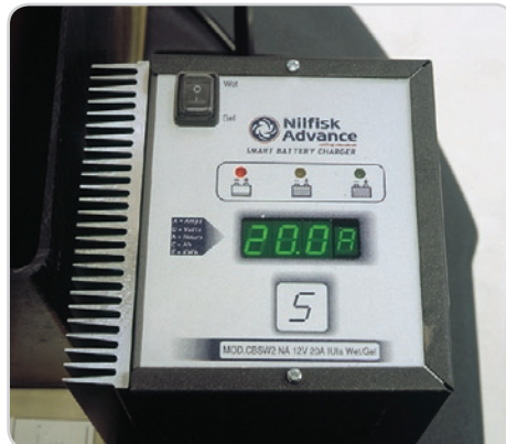
Convenient onboard charger provides flexibility to charge at anytime, anyplace.