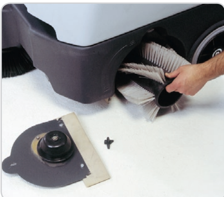
Main broom easily removed and replaced without the use of tools.