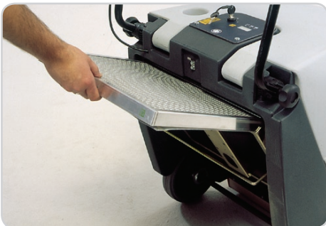
Two stage dust control system for more effective dust control. Access filters without tools.