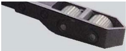
Toe Guard (Optional)