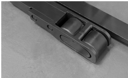
Bolt-On Load Wheel Boxes